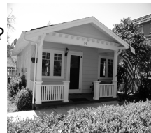
A Craftsman Bungalow Porch Grass Valley St