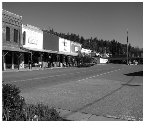
Main Street Colfax One Early Morning