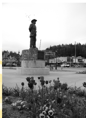
Colfax Sites