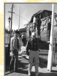
Evaluating the Caboose Project