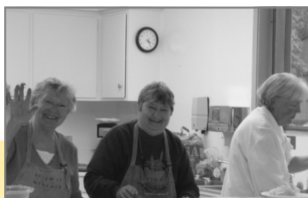
The Cooks Having Fun CAHS 25yr Anniversary Celebration