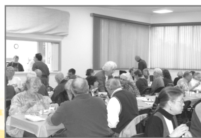
A Wonderful Turnout Helping CAHS Celebrate