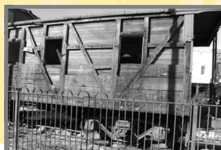
Work Has Started On the Downtown Caboose: Info pg 5