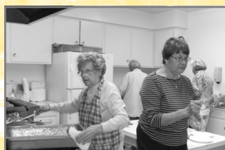
Thanks to Everyone We Couldn't Do It Without You!