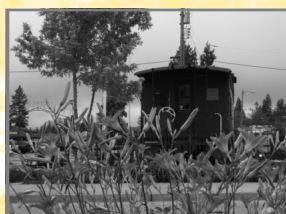
Day Lilies Brighten the Caboose Work