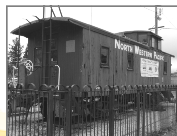
Progress on Caboose