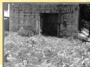
The Door to Nowhere