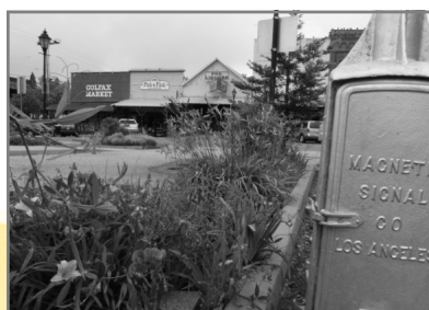
Summer is Blooming