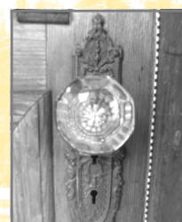
Old Victorian Door