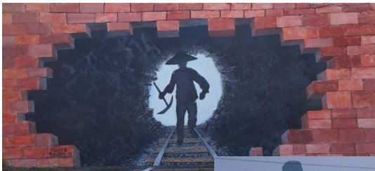
5 "The Black Hole"