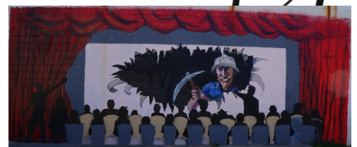
7 "Break Out"