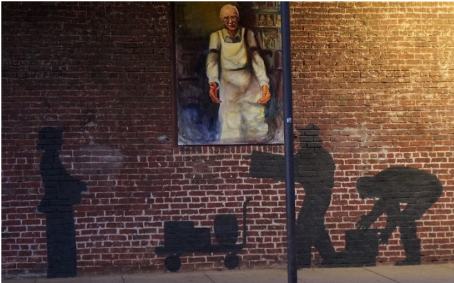
4 "The Mercantile"