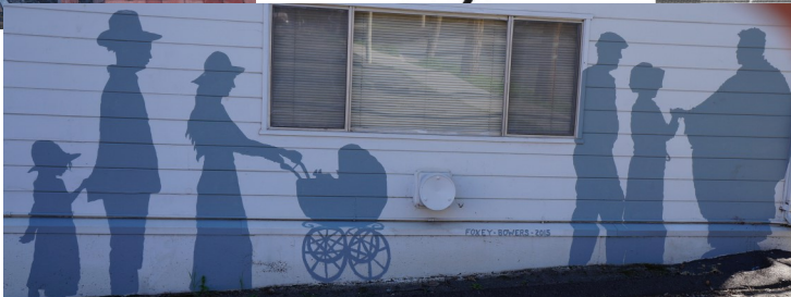
6 "The Parishioners"