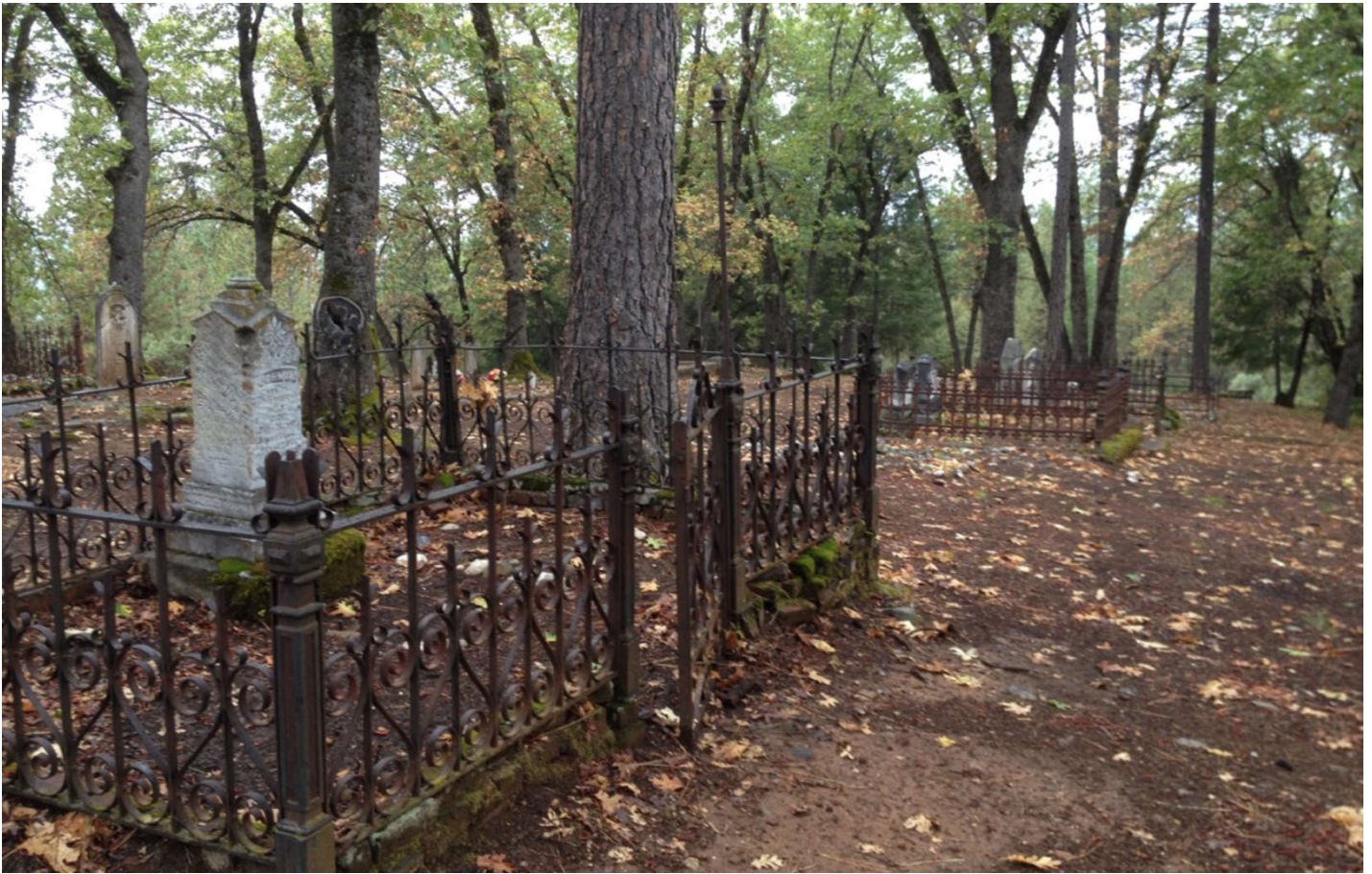
The Iowa Hill Community Cemetery, Iowa Hill, California

The Iowa Hill Community Cemetery, Inc., has an opening for the position of treasurer