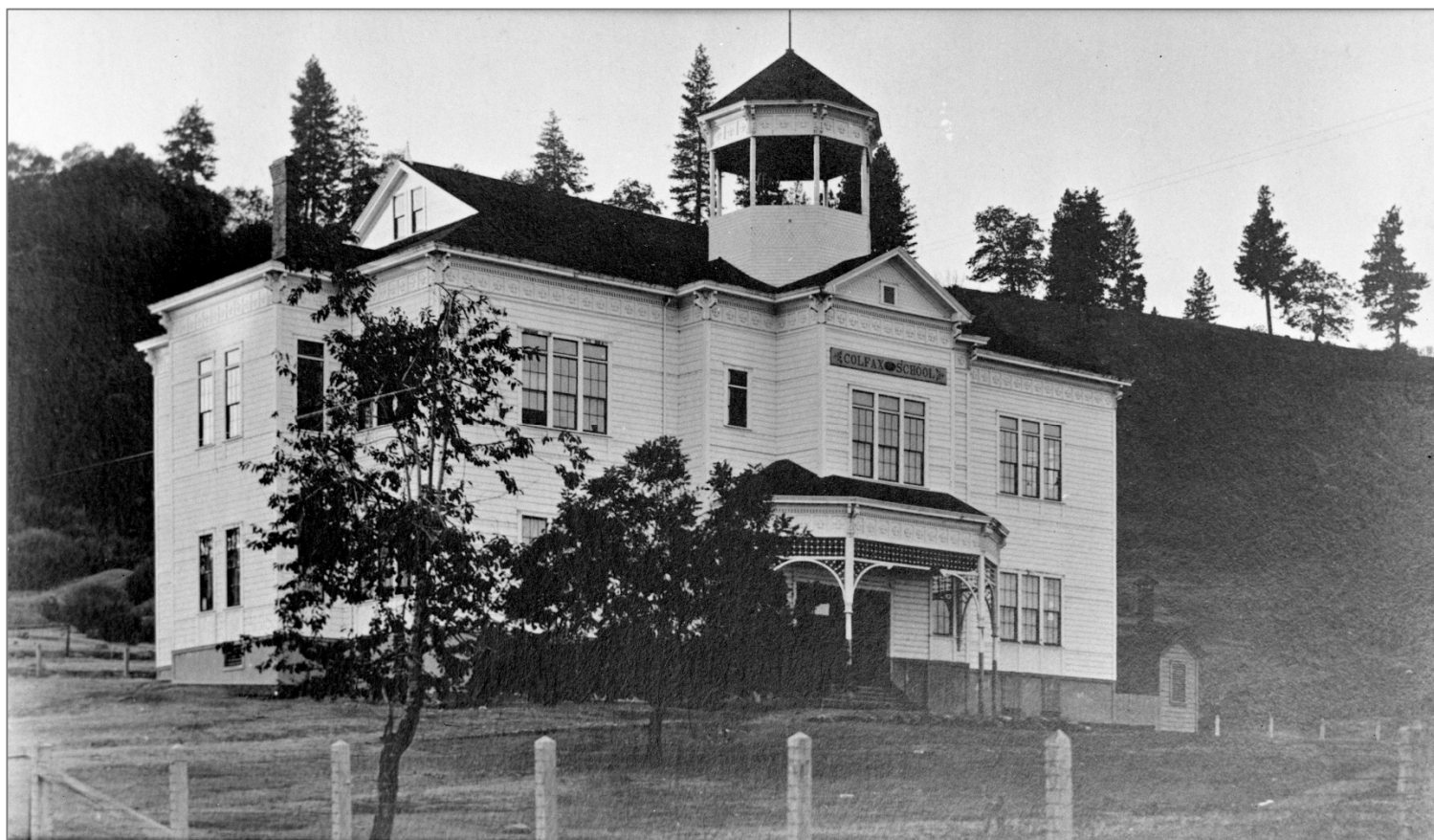
The Colfax School, Colfax California, circa 1890. This is a photo from the Bowers/Keck collection of negatives and photos recently acquired by the Colfax Area Historical Society.

Primarily, our goal is to open public access to the treasures of the museum and the Archives via the internet. Maybe, ultimately, you will be able to share your treasures, too.