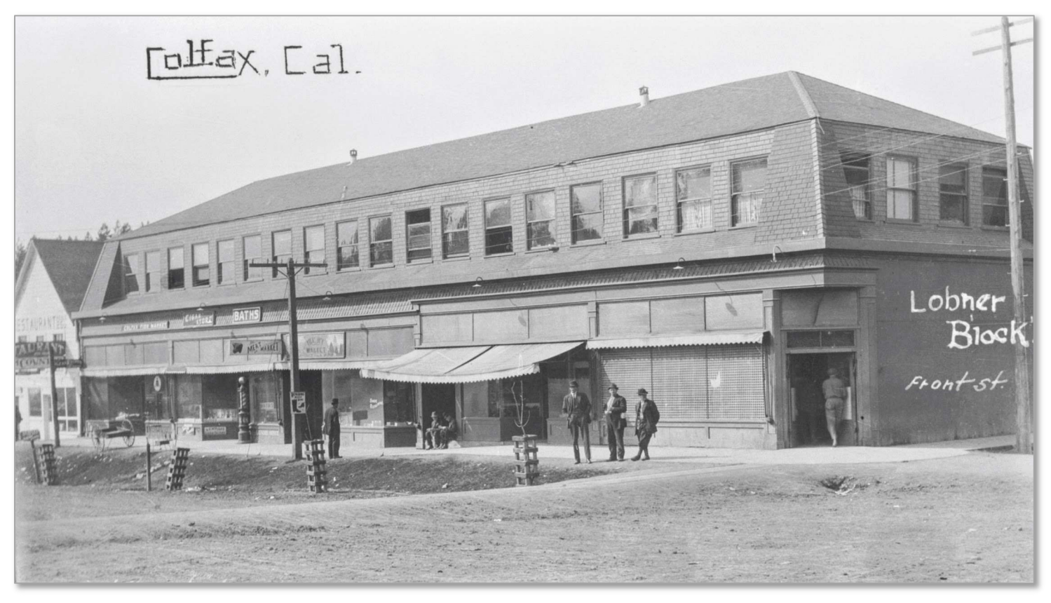
The Lobner Block, Colfax, California, 1900. This was located on Front Street, which is now Main Street.